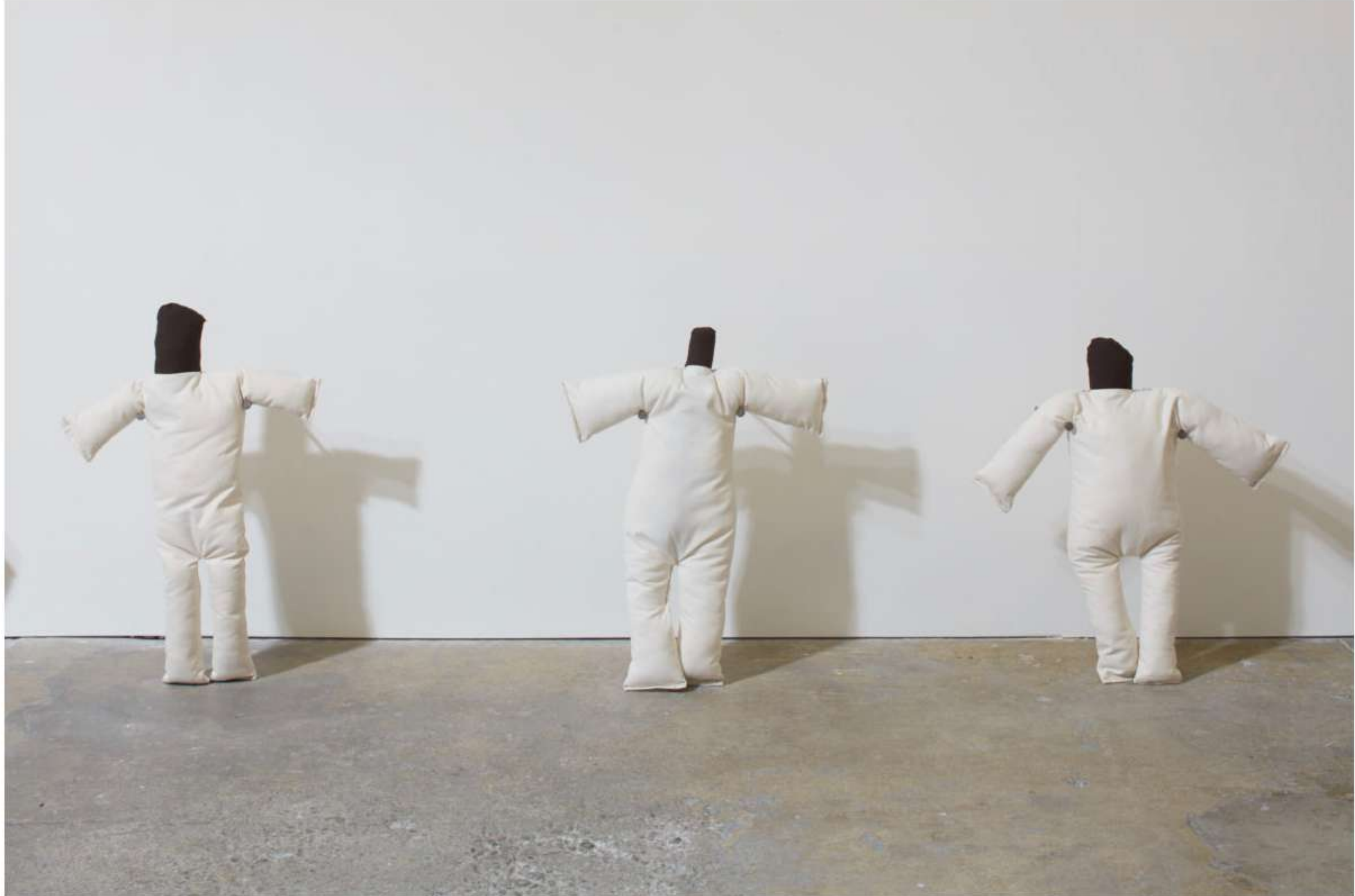
Full gallery of images, press release and link available after the jump.