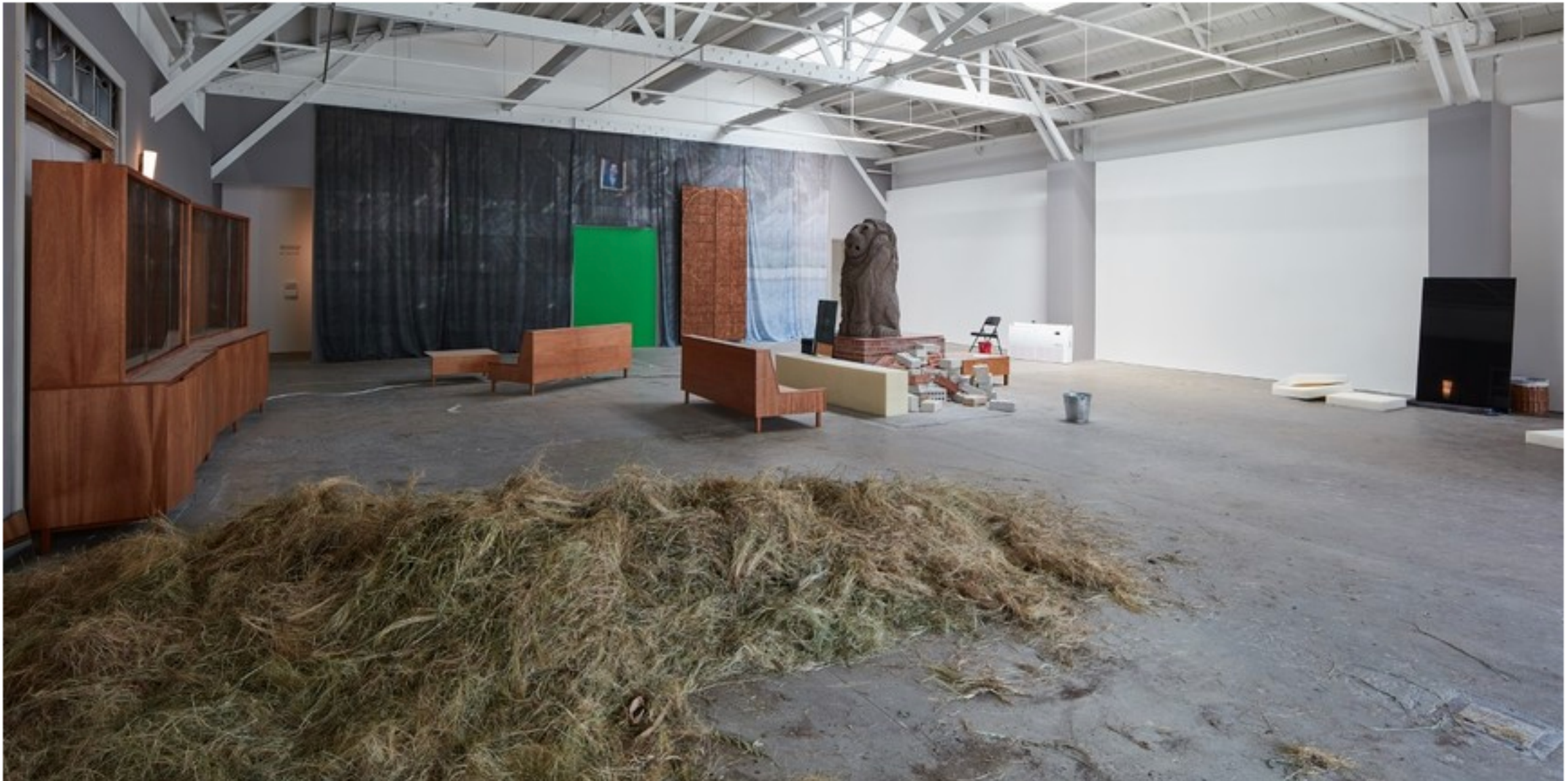
Installation view of ABBAS AKHAVAN's "Cast for a Folly," at the CCA Wattis Institute for Contemporary Arts, San Francisco, 2019.

What else surprised me? Definitely the wealth discrepancy—the way you see people suffer on the street and you just step over nearly dead humans. It's not unique to San Francisco, but the difference in the US is that if you trip, you die. If you don't have wealth, any injury could be life-threatening. Having said that, maybe this is less about place and more about time. As in it's symptomatic of today, when we respond with cruelty towards poverty, not giving much thought to what's happening to infrastructures of welfare and community that protect and care for life.